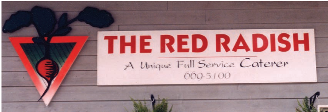
Hand lettered on 2-by-8-ft. AlumaCorr™ panel. The radish is carved Sign•Foam high-density urethane board on a 3-by-3-ft. sandblasted panel.