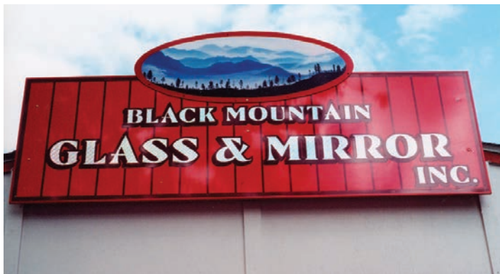
"Cracked ice" holographic film [Graphic Films, Inc., 800-634-7523, www.fdcfilms.com] panels on 3-by-8-ft. AlumaCorr™ panel with plastic trim. The graphic is hand painted and airbrushed on Fiber Brite™ [US Highway Products, 800-883-8363, www.fiberbrite.com] board, clear coated with Frog Juice [Far from Normal Supply, 800-877-1907].