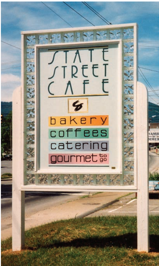
Hand lettered and airbrushed on 4-by-6-ft. overlaid plywood panel finished with Chromatic® enamel [1Shot, 219-949-1684, www.1shot.com]. The framed glass block is attached to 4-by-4-in. posts.

We knew it was time to stop traveling when I started yearning for a compost pile and a garden—there are some things you just can't do in a bus! When we found Black Mountain, North Carolina, we knew we'd found the place to stop. We opened the Black Mountain Sign