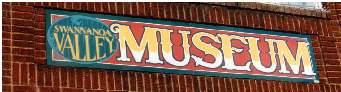
Hand lettered and airbrushed on 2-by-8-ft. panel of 1/2-in. overlaid plywood

Studio in 1992, and have been here ever since. Black Mountain is a tiny, tourist town (population 8000) whose sign painter had recently passed away. Though we're not wealthy, we have a very rich life here—I'm involved in many civic organizations, helped to write the sign ordinance and find it so wonderful that I can smile and wave to folks on the street downtown.