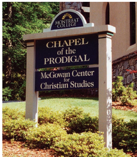
Vinyl film on 18-by-42-in. aluminum panel finished with two-part urethane [Akzo Nobel Coatings, 770-662-8464, www.signfinishes.com ]. The header was sandblasted in redwood then cast in resin by Goldenwest Manufacturing [530-272-1133].