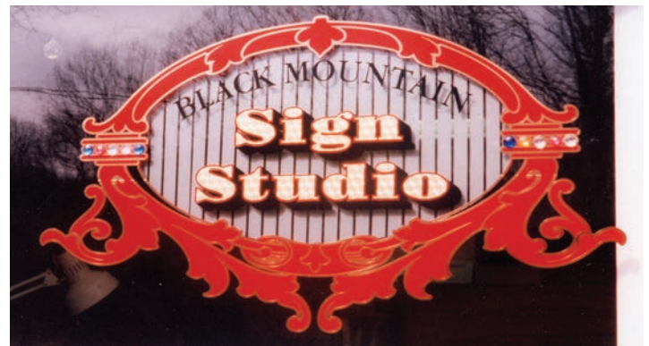
All vinyl graphics with etched glass film [Graphic Films, Inc.] background to add depth