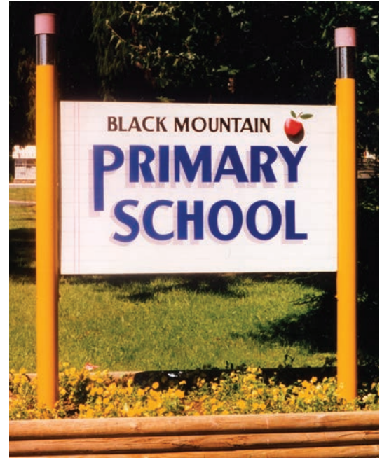
Hand lettered on 3-by-4-in. overlaid plywood panel. The apple is carved Sign•Foam high-density urethane board. The pencils are PVC posts, primed and painted with lettering enamel and finished with gold vinyl finials.