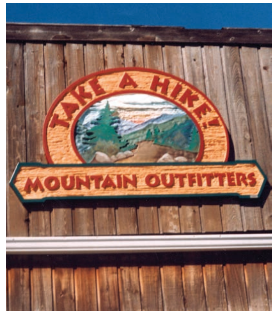
Sandblasted 4-by-7-ft. Sign•Foam high-density urethane panel