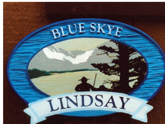
Sandblasted 12-by-18-in. Sign•Foam high-density urethane panel